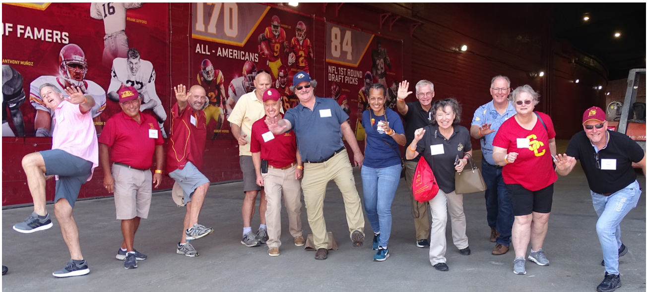
Bottom: Hanging out in the Wardroom