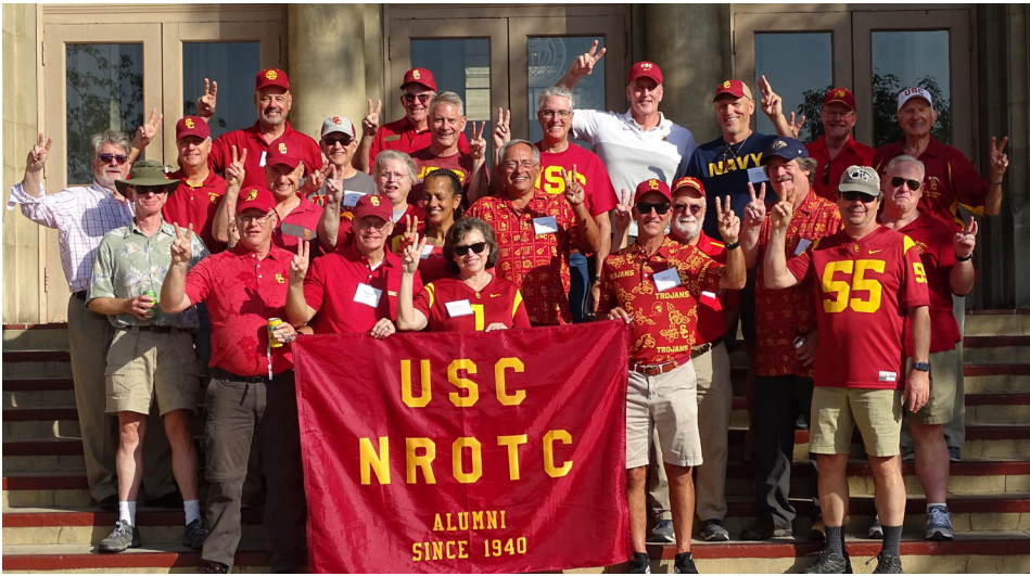
Group Photos from the Classes of 1981 and 1982 Reunion Sept 16 and 17, 2022: