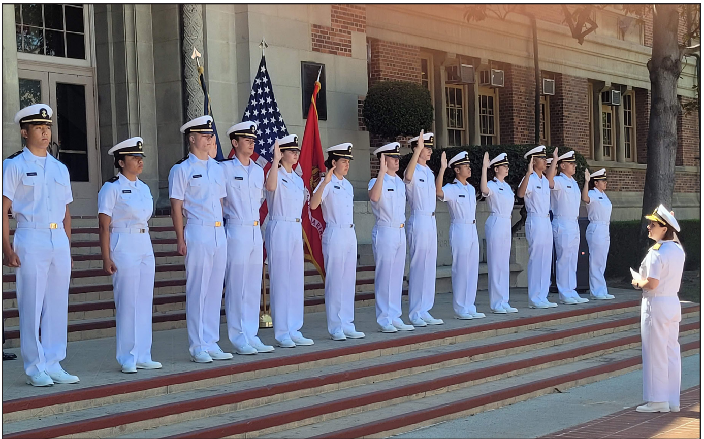
Freshmen Swearing-in Ceremony August 2022